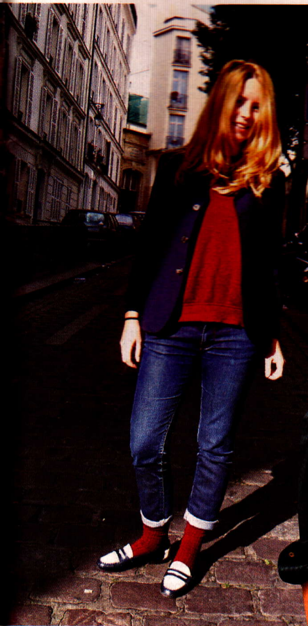
"young, fresh, smiley, sweet, and creative. jeans, jacket, hair flying in the air, she is so naturally beautiful."